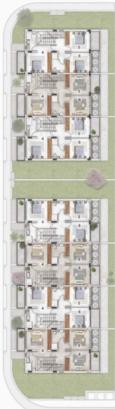
MAISONETTES FIRST FLOOR PLAN