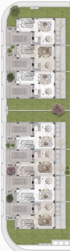
MAISONETTES GROUND FLOOR PLAN