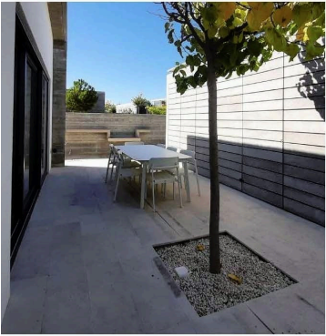
The Plateau 15