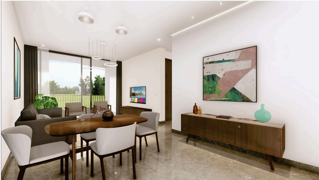
TROUZERI / ARCHITECTURE & INTERIOR CONCEPT