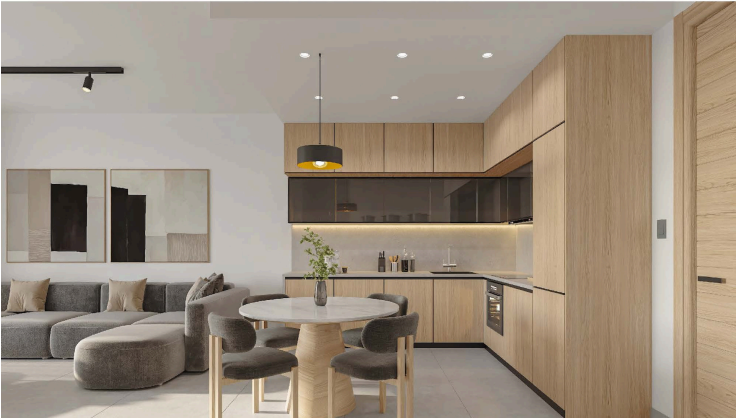
OPTION I: BOLD