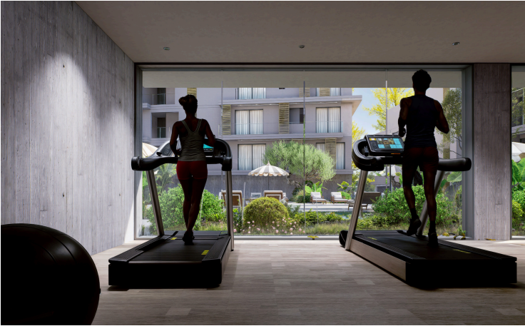
OPTION I: BOLD